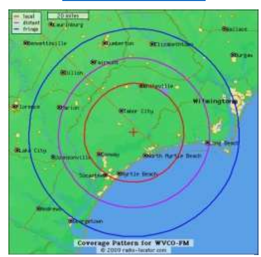
25,000 Watts – Loris, SC